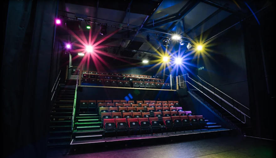
The William Thomas Theatre

The venue is easily accessible by motorway and public transport links and is close to local amenities with regular bus services stopping nearby. There is also a free car park directly outside the venue.